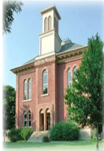
Boone County Courthouse

Advocates are appointed by the Court to thoroughly